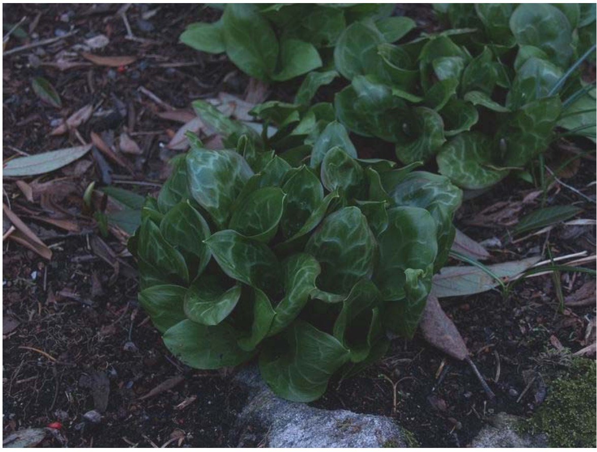
E. 'White Beauty' leaves

Erythronium 'Craigton Beauty' is a selection raised from seed of E. 'White Beauty' which has stronger growth, with generally more flowers to the stem than the seed parent - it also has better marked leaves and red flower stems. I suspect that the increased strength of 'Craigton Beauty' is due to it being relatively recently raised from seed while 'White Beauty' has been increased by division for over one hundred years now.