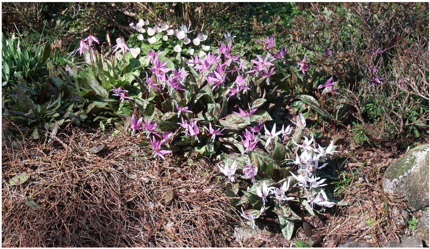
Trillium rivale and Erythronium dens canis

The rock garden bed is dotted with blue and yellow from the various Scilla and Narcissus while in the Erythronium plunge beds just the earliest species are flowering.