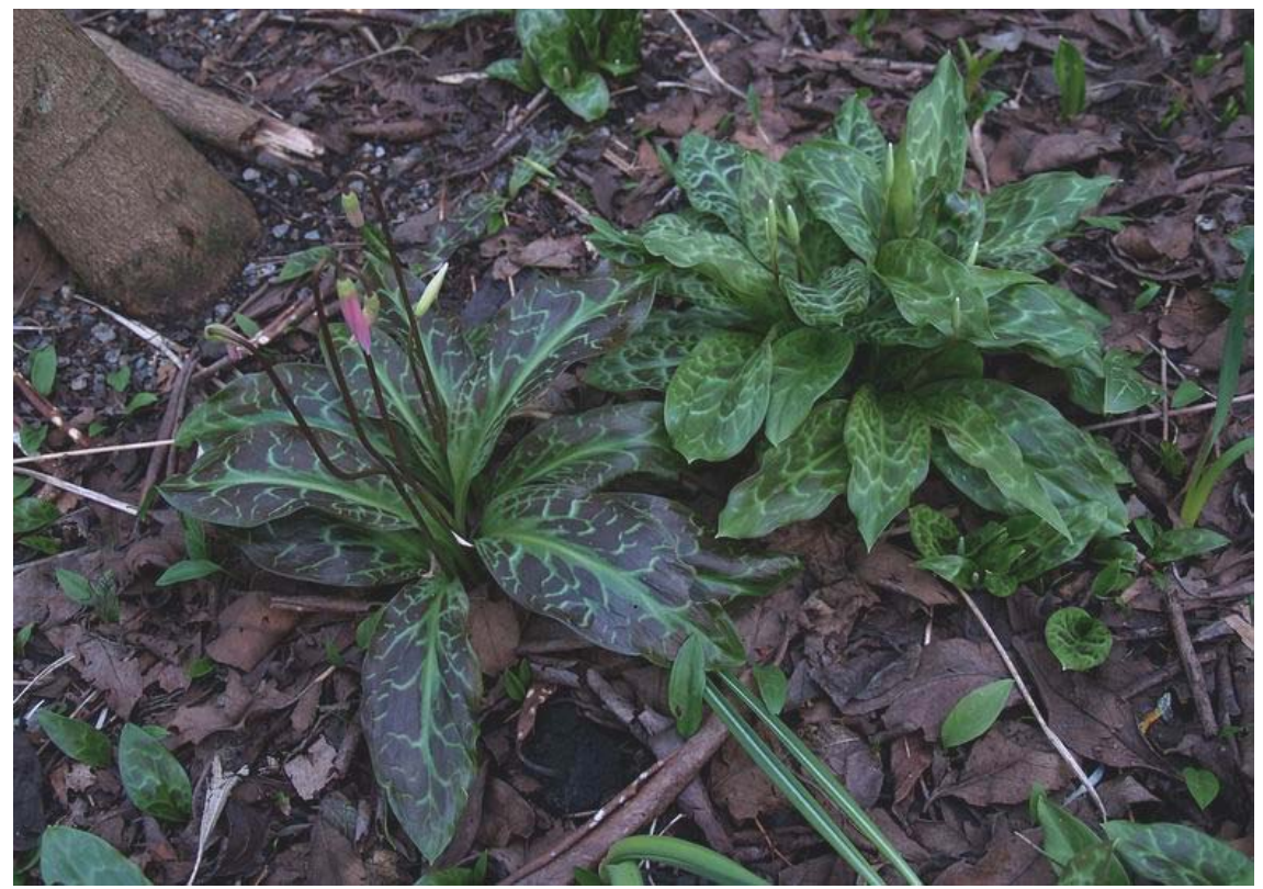
Erythronium revolutum clumps

The other observation is that since I planted out the bulbs singly some of them have started to clump up quite well while others remain as single bulbs. This is also the area where I just leave the seeds to their own devices to self sow and naturalise and you can see the evidence of the seedlings of varying ages in this picture. All first and second year Erythronium seedlings leaves are plain green it is not usually until the third year that any evidence of the pattern starts to appear and it could be five years before you see the full extent of the pattern in all its glory.