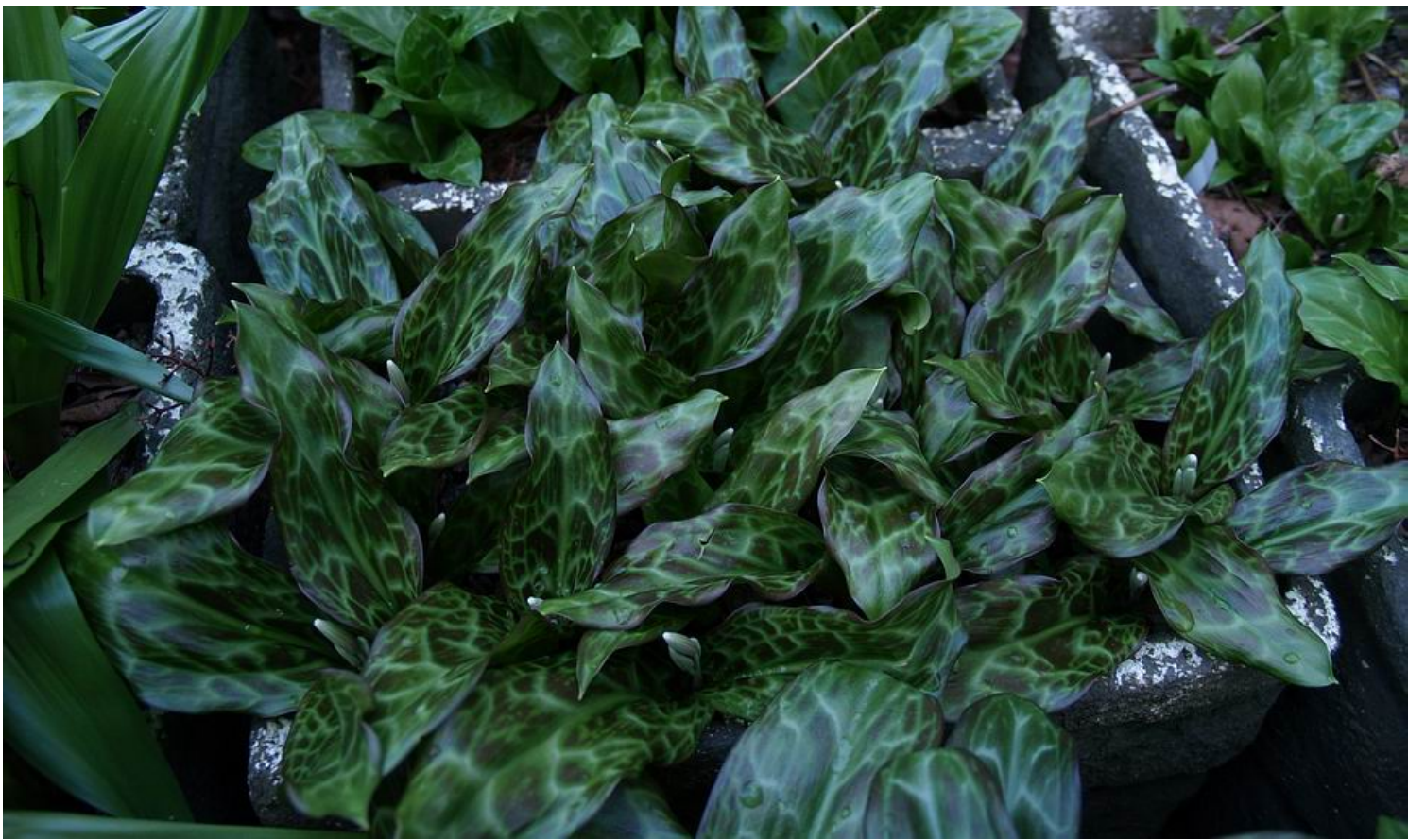
Erythronium 'Craigton Cover Girl' leaves

The other observation is that since I planted out the bulbs singly some of them have started to clump up quite well while others remain as single bulbs. This is also the area where I just leave the seeds to their own devices to self sow and naturalise and you can see the evidence of the seedlings of varying ages in this picture. All first and second year Erythronium seedlings leaves are plain green it is not usually until the third year that any evidence of the pattern starts to appear and it could be five years before you see the full extent of the pattern in all its glory.