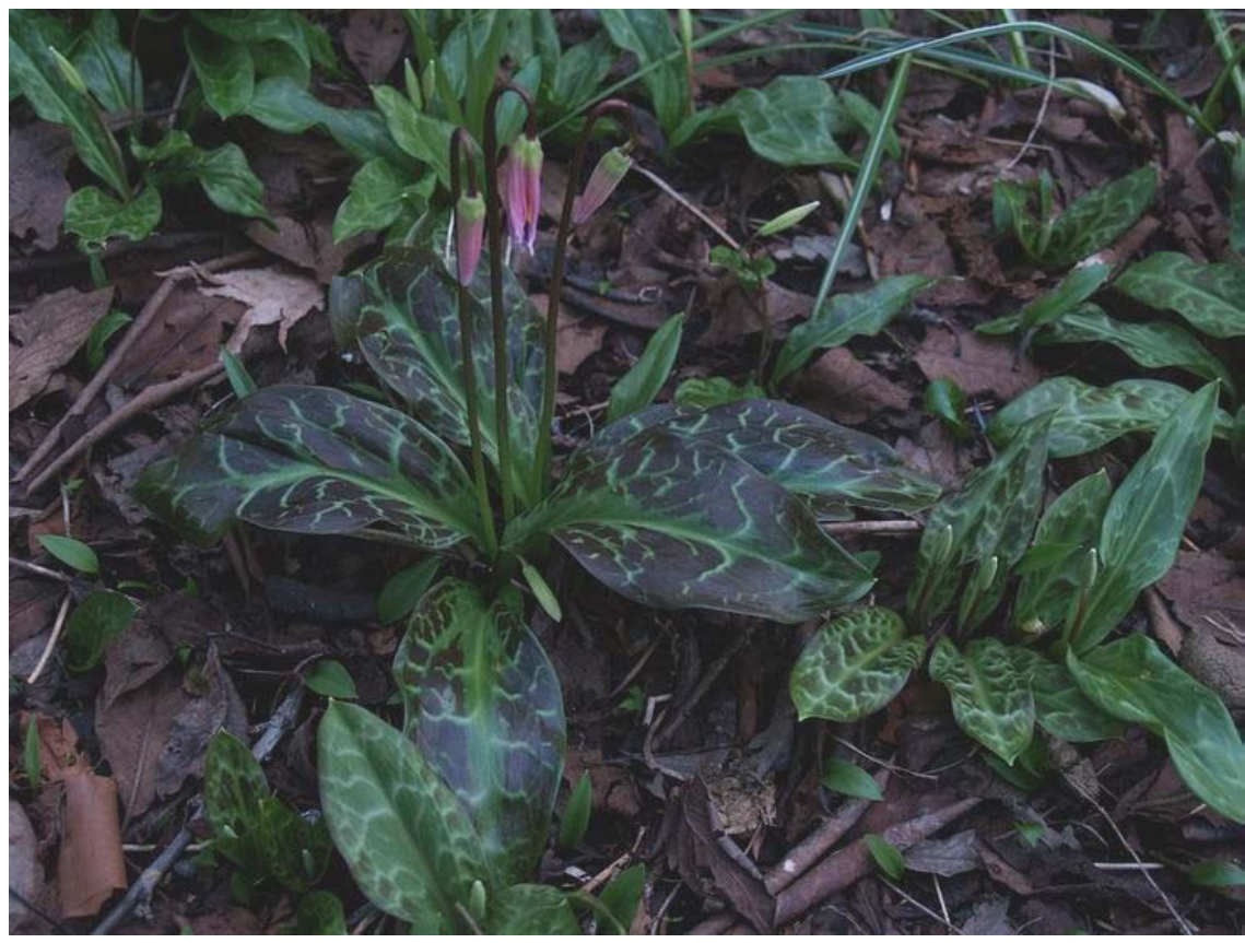
Erythronium revolutum leaves

In the back garden the Erythronium leaves are making a wonderful display showing just how variable and attractive they can be.