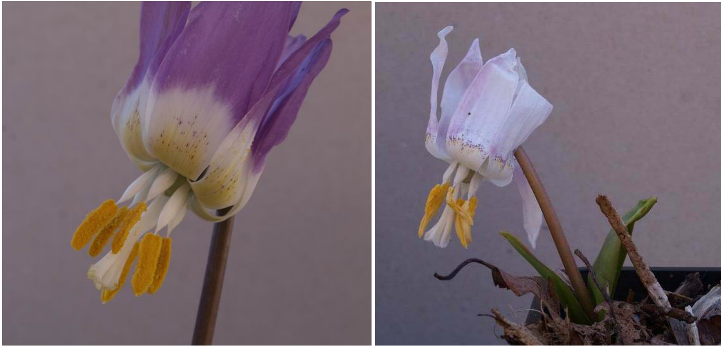
Erythronium sibericum and Erythronium sibericum 'Olja'

The last two pictures of Erythronium sibericum for just now shows the darker form from above alongside 'Olja' an almost white form with just a flush of violet in the petals.