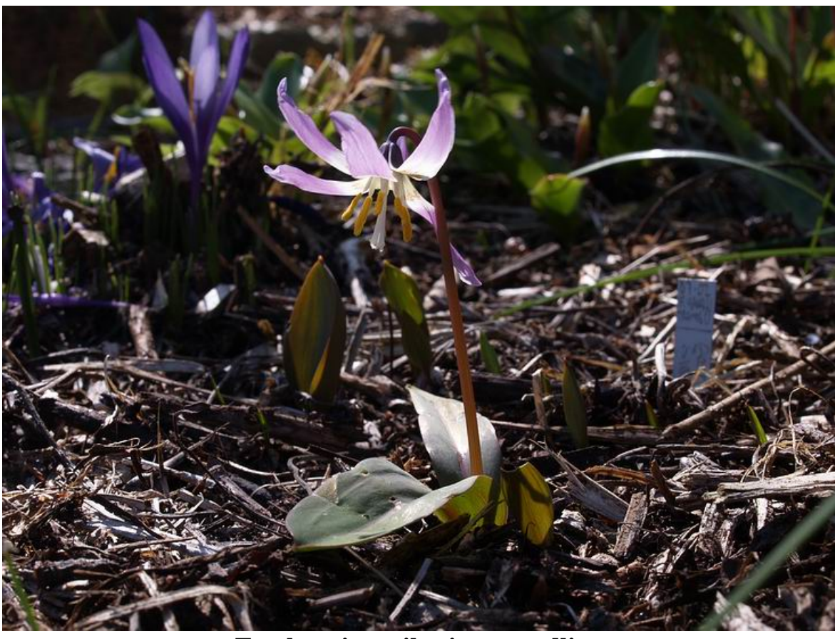
Erythronium sibericum seedling

I am so delighted that Erythronium sibericum has begun to enjoy growing in our garden. I have spent years obtaining bulbs and raising it from seed until I found clones that would take to our changeable climate and flower naturally instead of trying to open its flowers while they are still under ground . Flowers opening underground is a common problem with this species that is used to a cold winter followed by a sudden spring.