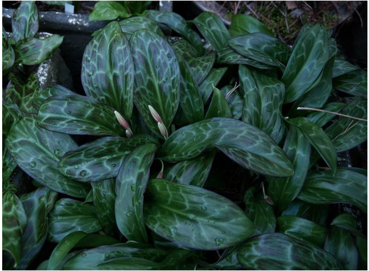
Erythronium 'Craigton Beauty' leaves

Erythronium 'Craigton Beauty' is a selection raised from seed of E. 'White Beauty' which has stronger growth, with generally more flowers to the stem than the seed parent - it also has better marked leaves and red flower stems. I suspect that the increased strength of 'Craigton Beauty' is due to it being relatively recently raised from seed while 'White Beauty' has been increased by division for over one hundred years now.